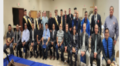
3rd Degree Formation Degree - October 29, 2022