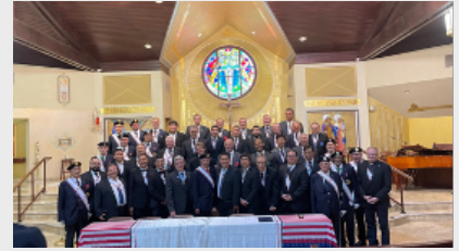
4th Degree Exemplification Ceremony - October 1, 2022